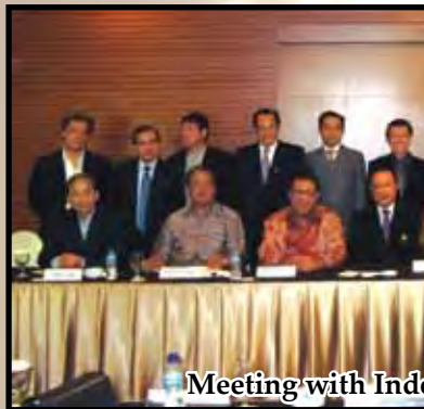
Meeting with Indo