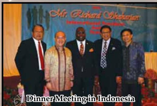
Dinner Meeting in Indonesia