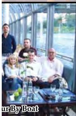
Tour By Boat