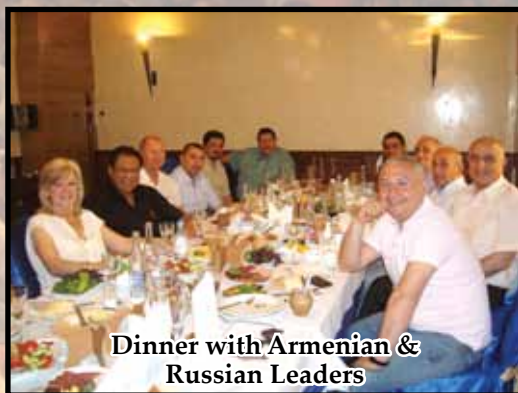
Dinner with Armenian & Russian Leaders