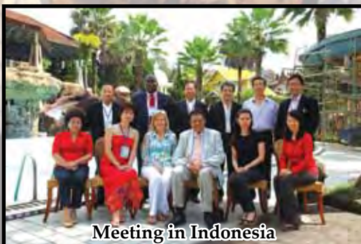
Meeting in Indonesia